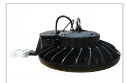
Shown with OPTIONAL MOTION SENSOR KIT #HBE-F-MS-IO