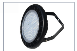
Shown with OPTIONAL YOKE #HBE-yoke

Suitable for use in hockey rinks and food processing facilities