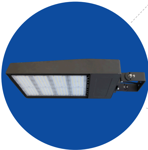
Standard Trunnion Mount Product #: FL03-300W