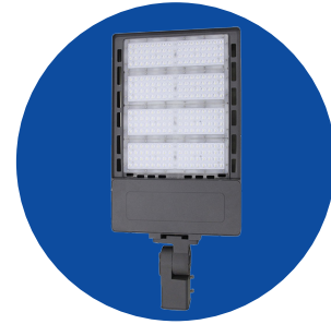
Optional Adjustable Slip Fit Mount (Type A) Product #: FL03-TA