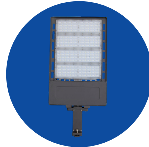
Optional Round Pole Arm Mount (Type B) Product #: FL03-TB