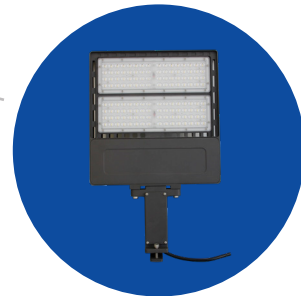
Optional Square Pole Arm Mount (Type C) Product #: FL03-TC