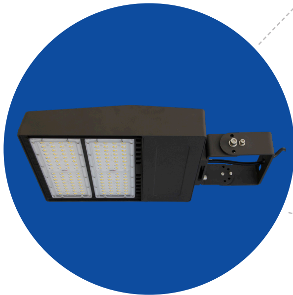
Standard Trunnion Mount Product #: FL03-200W