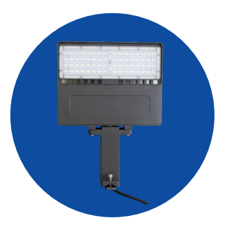
Optional Round Pole Arm Mount (Type B) Product #: FL03-TB