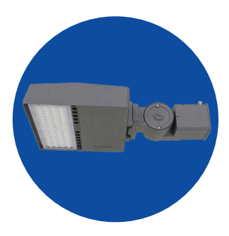
Optional Adjustable Slip Fit Mount (Type A) Product #: FL03-TA