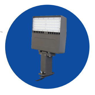
Optional Square Pole Arm Mount (Type C) Product #: FL03-TC