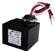
Stepdown transformer available for 347V applications (210041E) Mounts directly to driver box.