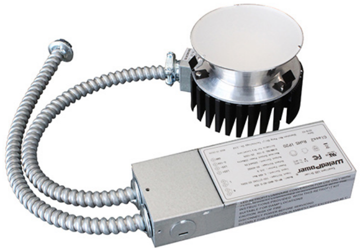
High efficiency driver and selected light engine. Fits all reflector sizes

Step 2 Choose your Reflector 4", 6", 8", or 10"