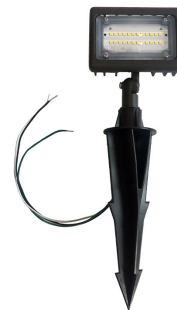
FLM-STK Pictured: FLM-15W with Stake

Pictured: FLM fixtures with standard Yoke Mount