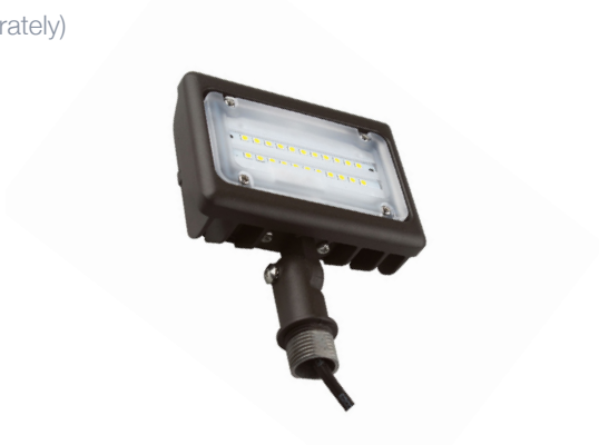
FLM-15W-40K-KN Pictured: FLM-15W with Knuckle Mount