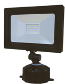
Shown with round junction box