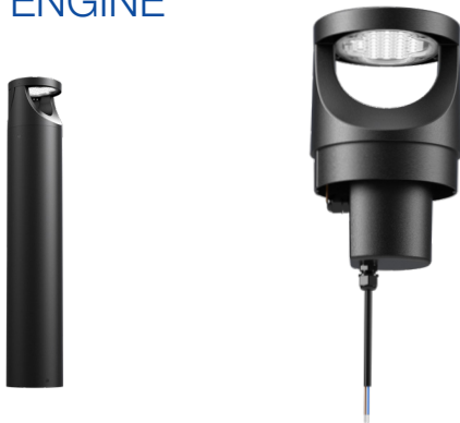
*PICTURED WITH BASE POLE (SOLD SEPARATELY) BL01-14W-4P-3CCT-UD