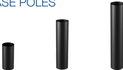
BL01-BASE19 BL01-BASE35 BL01-BASE42

Choose from 19", 35", and 42" Base Poles