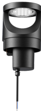
*PICTURED WITH BASE POLE (SOLD SEPARATELY)