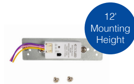
12V Motion Sensor* MS02-MW-HW-DC

Accessories to meet your projects every need (sold separately)