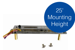
12V Motion Sensor* MS03-MW-HW-DC