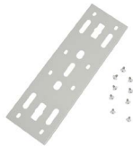
Connection Bracket ST-CONN-BKT