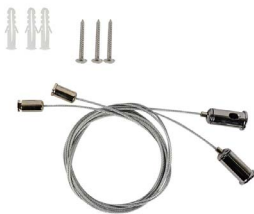
Suspension Kit ST-SUS-KIT