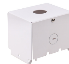
Pendant Mount LHB04-BKT | LHB04-BKT-XL