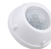
Infrared Motion Sensor MS01-PIR-TW-DC