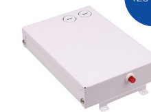
Emergency Driver YH36-25WL-300