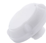
Motion Sensor MS04-MW-TW-DC

Accessories to meet your projects every need (sold separately)